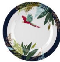
S/4 Melamine Salad 8"