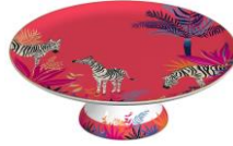
Footed Cake Plate (Zebra)