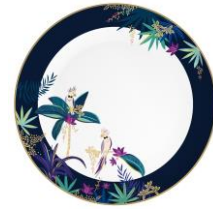
Round Platter 12" (Cockatoo)