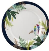
S/4 Melamine Dinner 11"

Colorful parrots and tropical fronds decorate the Sara Miller Parrot Melamine Collection. The collection, priced $29.99-$39.99 for sets of 4, is dishwasher safe and BPA free. Coordinating placemats (set of 4) at $40.00 and coasters (set of 6) at $15.00 complement both Tahiti and Parrot collection.